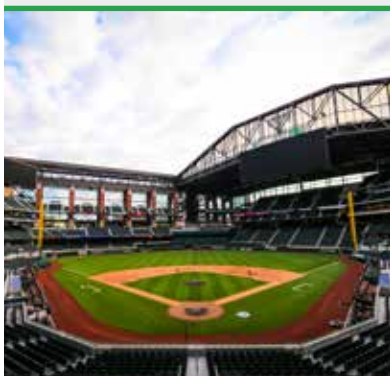
KELLY GAVIN/TEXAS RANGERS