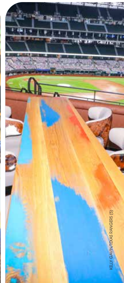
KELLY GAVIN/Texas Rangers