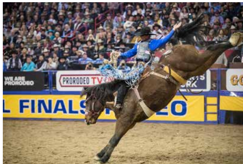
The Wrangler National Finals Rodeo (NFR), the first non-baseball event for Globe Life Field, will be held in December.