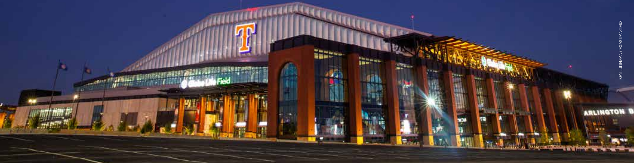
BEN LUDWIG/Texas Rangers